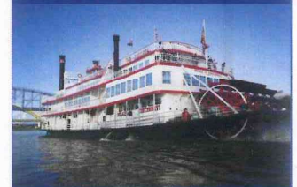
Enjoy a BB Riverboats Sightseeing Cruise