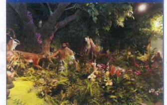
Visit to the Amazing Creation Museum!